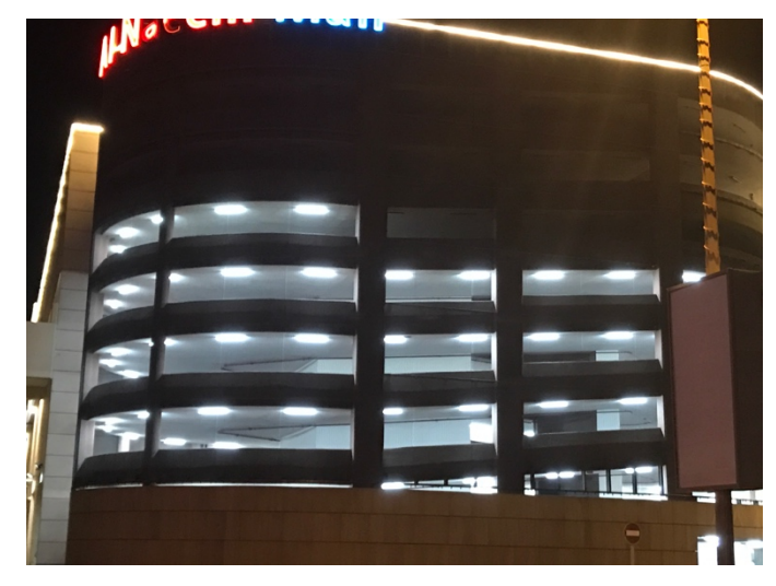
Al-Naeem Mall-RAK LED Parking & Retrofit Lighting