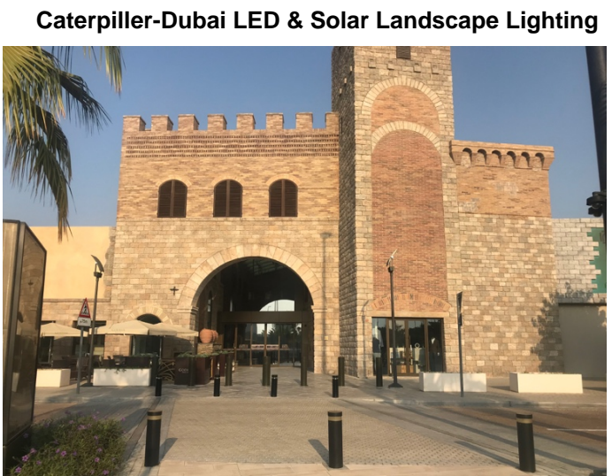
MEERAS Outlet Village-Outdoor Solar Lighting