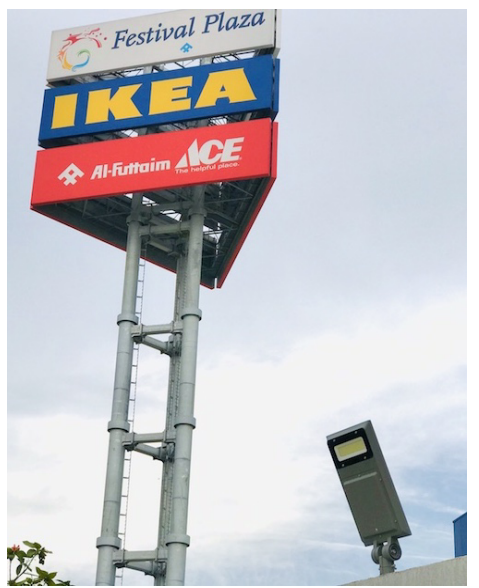
ating Microsoft Solar outdoor Lighting